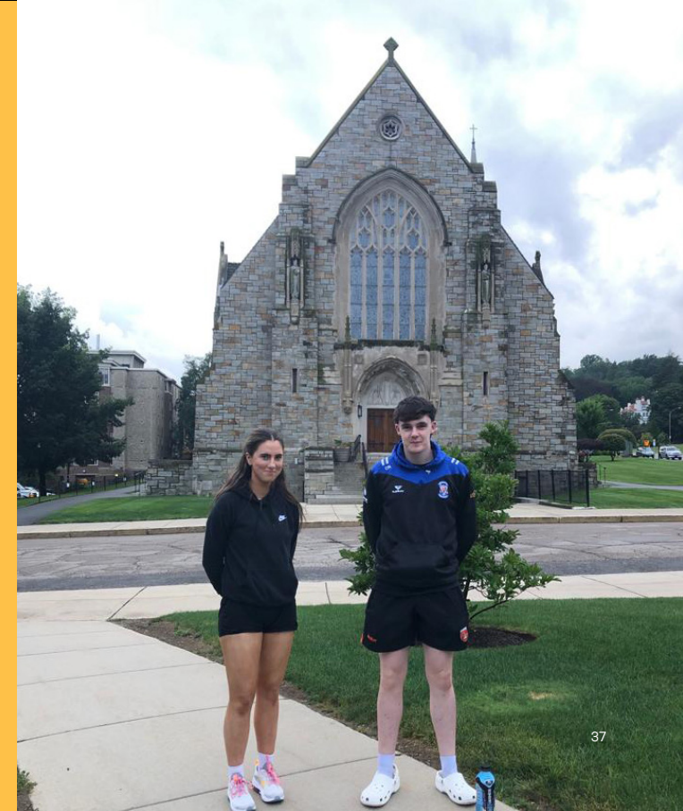
The 2022-2023 Helen McRory Scholarship recipients:

Recipient of Cairde Brogán Scholarship 2022-2023